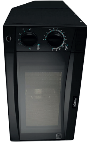
Rear Mount Model

Width - 530mm Height - 260mm Depth - 330mm Weight - 15KG