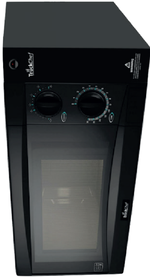
Side Mount Model