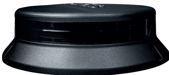
Part No. 850950 CRUISE LIGHT SURFACE MOUNTING