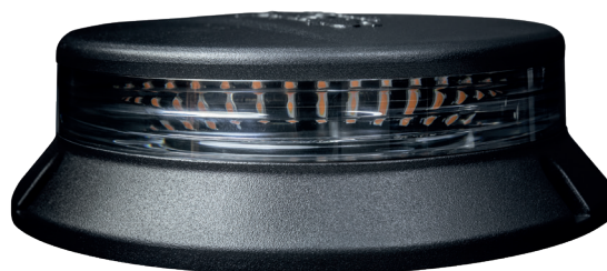
Part No. 850952 CRUISE LIGHT SURFACE MOUNTING