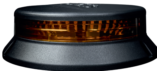
Part No. 850954 CRUISE LIGHT SURFACE MOUNTING