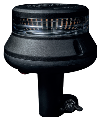
Part No. 850934 CRUISE LIGHT DIN/POLE MOUNTING