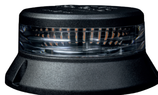
Part No. 850933 CRUISE LIGHT SURFACE MOUNTING