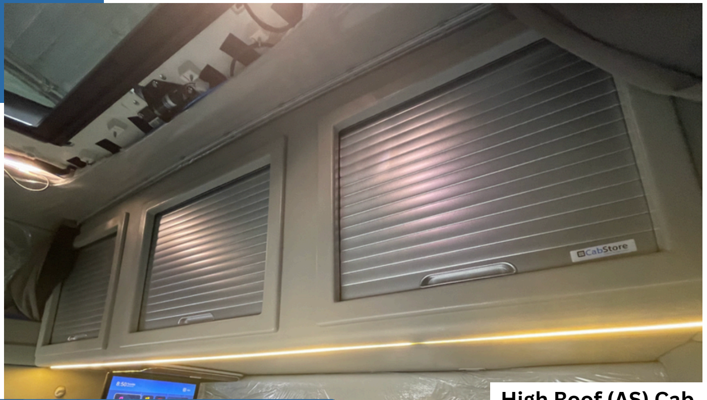
High Roof (AS) Cab