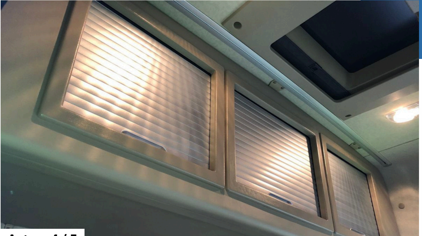
Actros 4 / 5