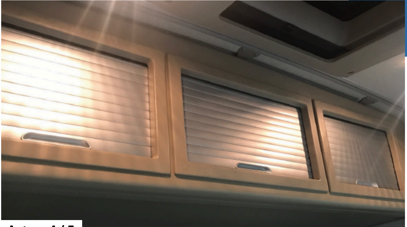
Actros 4 / 5