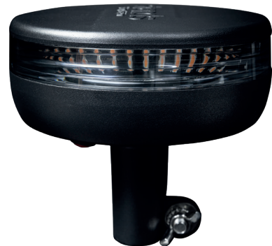
Part No. 850953 CRUISE LIGHT DIN/POLE MOUNTING