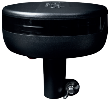
Part No. 850951 CRUISE LIGHT DIN/POLE MOUNTING