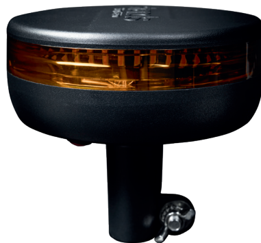
Part No. 8600955 CRUISE LIGHT DIN/POLE MOUNTING