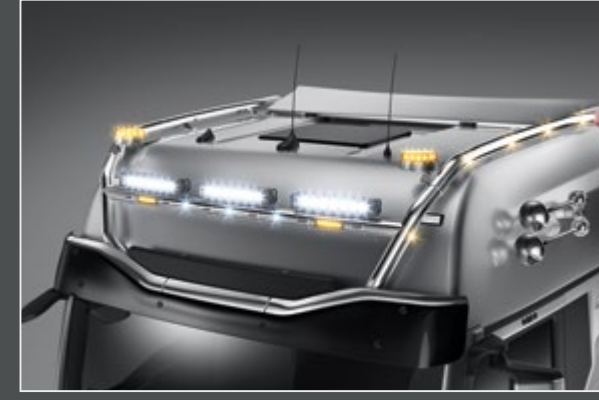
21705-7-P - LightFix - SKY-LIGHT "H-MAX" Lightbar for mounting a maximum of 6 spotlights and 2 beacons stainless steel - polished - Ø 70mm - prewired amber LEDs on the side and red LEDs in the tube ends Note: also suitable for model range until 2021