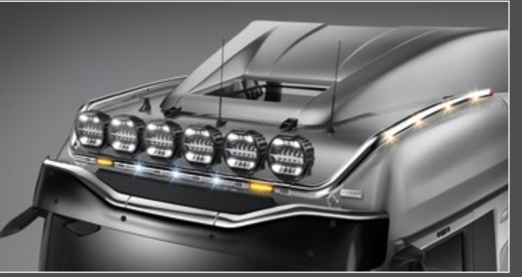
21702-10-P - LightFix - SKY-LIGHT "WILDLIFE MAX" Lightbar for mounting a maximum of 6 spotlights and 2 beacons stainless steel - polished - Ø 70mm - prewired amber LEDs on the side and red LEDs in the tube ends Note: for model range until 2021 select 21702-6-P