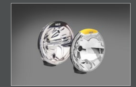
LightFix - SPOTLIGHT-BOX fitted with NBB Alpha 225 LED

BOX4-A225LED-B · NBB Alpha 225 LED · clear lens · Full-LED BOX6-A225LED-B · NBB Alpha 225 LED · clear lens · Full-LED