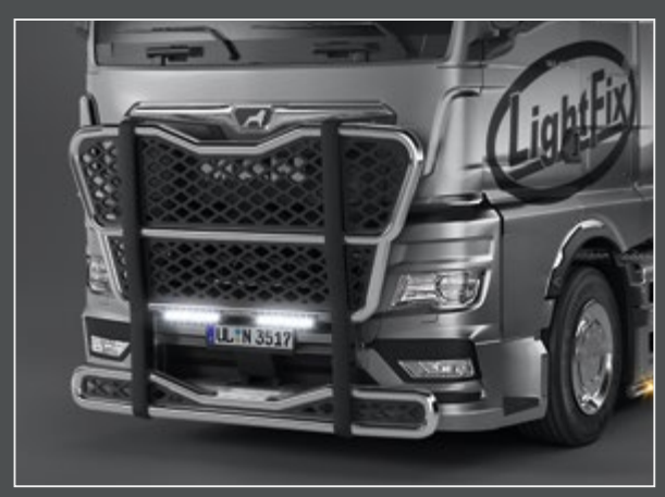
21760-4-P - LightFix - FRONT-PROTECT "BIG NORDIC" Stainless steel front protection bar incl. black net made of ABS polished - Ø 70mm - prewired 29708-1-P - LightFix - LAZER-BRIDGE for 2 Lazer Triple-R 1000

21715-2-P- LightFix - REAR-LIGHT for mounting on the roof spoiler Lightbar for mounting a maximum of 4 worklamps and 2 beacons stainless steel - polished - Ø 70mm - prewired