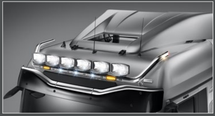
21702-9-P - LightFix - SKY-LIGHT "WILDLIFE" Lightbar for mounting a maximum of 6 spotlights and 2 beacons stainless steel - polished - Ø 70mm - prewired red LEDs in the tube ends Note: for model range until 2021 select 21702-4-P