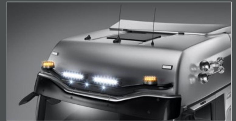
21706-2-B - LightFix - SKY-LIGHT "WING" Lightbar for mounting a maximum of 4 spotlights and 2 beacons stainless steel - black powdercoated (paintable) - Ø 70mm - prewired Note: for model range until 2021 select 21705-2-B