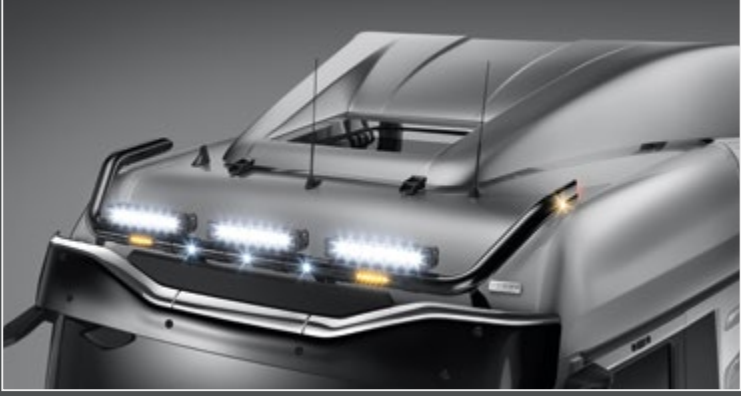
21702-9-B - LightFix - SKY-LIGHT "WILDLIFE"

Lightbar for mounting a maximum of 6 spotlights and 2 beacons stainless steel - black powdercoated (paintable) - Ø 70mm - prewired amber LEDs on the side and red LEDs in the tube ends Note: also suitable for INDIVIDUAL sun visor