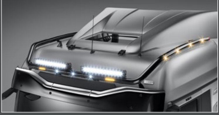
21702-10-B - LightFix - SKY-LIGHT "WILDLIFE MAX" Lightbar for mounting a maximum of 6 spotlights and 2 beacons stainless steel - black powdercoated (paintable) - Ø 70mm - prewired amber LEDs on the side and red LEDs in the tube ends Note: for model range until 2021 select 21702-6-B