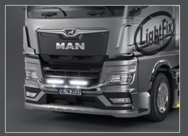
21720-6-P - LightFix - 4-LIGHT "MINI" Lightbar at the front for mounting a maximum of 4 spotlights stainless steel - polished - Ø 70mm - prewired