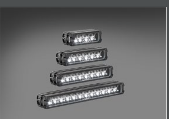
LightFix - SPOTLIGHT-BOX fitted with Lazer Triple-R

BOX4-SENT-B · Lazer SENTINEL-BLACK · clear lens · Full-LED with LED-position light BOX6-SENT-B · Lazer SENTINEL-BLACK · clear lens · Full-LED with LED-position light