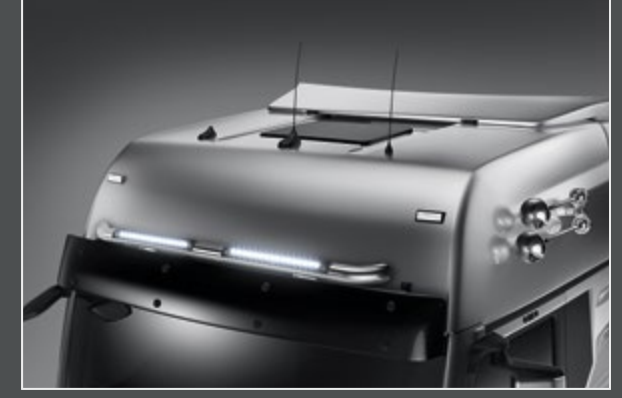
21705-3-P - LightFix - SKY-LIGHT "SLIM" Lightbar for mounting 2 integrated LED spotlights stainless steel - polished - Ø 70mm - prewired Note: not suitable for model range from 2022