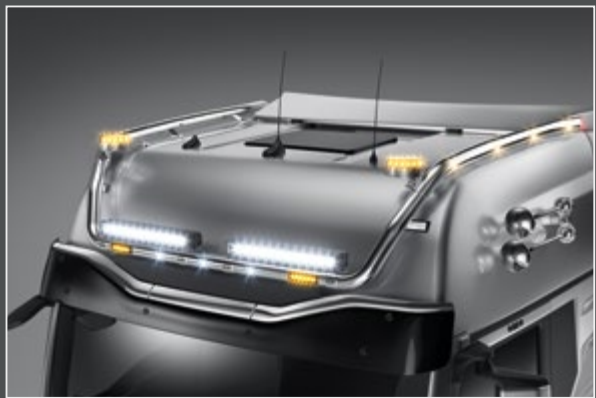
21706-5-P - LightFix - SKY-LIGHT "WILDLIFE MAX" Lightbar for mounting a maximum of 6 spotlights and 2 beacons stainless steel - polished - Ø 70mm - prewired amber LEDs on the side and red LEDs in the tube ends Note: for model range until 2021 select 21705-5-P