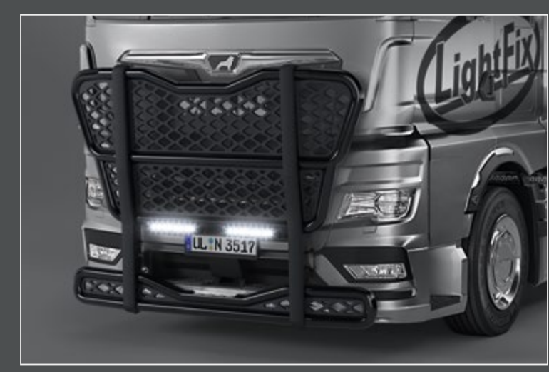
21760-4-B - LightFix - FRONT-PROTECT "BIG NORDIC" Stainless steel front protection bar incl. black net made of ABS black powdercoated - Ø 70mm - prewired 29708-1-B - LightFix - LAZER-BRIDGE for mounting 2 Lazer Triple-R 1000

21715-2-B - LightFix - REAR-LIGHT for mounting on the roof spoiler Lightbar for mounting a maximum of 4 worklamps and 2 beacons stainless steel - black powdercoated - Ø 70mm - prewired