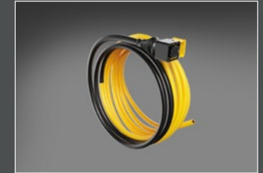
29290-6 LightFix Cabin connection cable