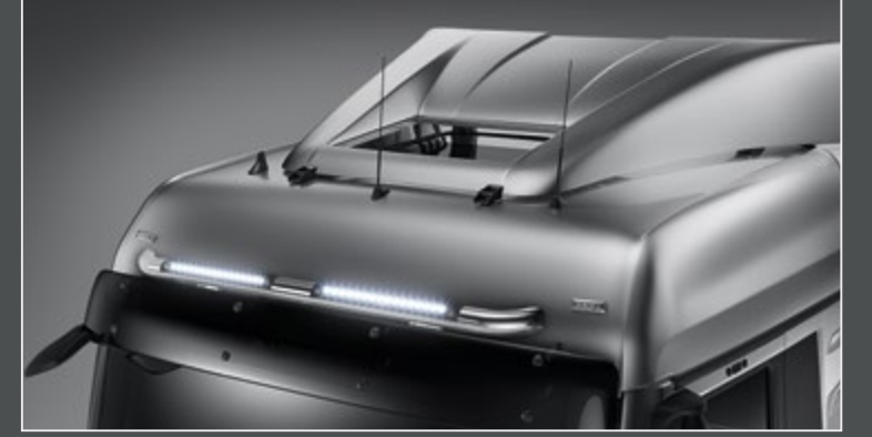
21705-3-P - LightFix - SKY-LIGHT "SLIM" Lightbar for mounting integrated LED spotlights stainless steel - polished - Ø 70mm - prewired Note: not suitable for model range from 2022