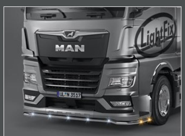
21741-2-P - LightFix - FRONT-LINER "N" Stainless steel LED-lightbar at the front polished - Ø 60mm - prewired Full LED set included