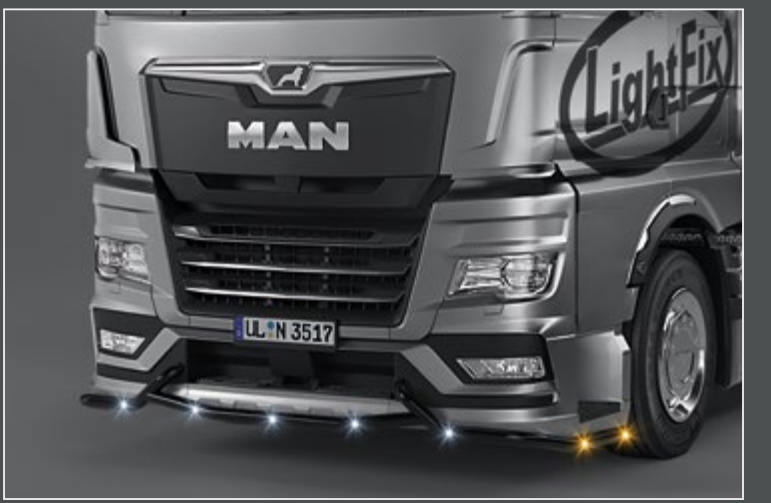
21741-1-B - LightFix - FRONT-LINER "S" Stainless steel LED-lightbar at the front black powdercoated - Ø 60mm - prewired Full LED-set included