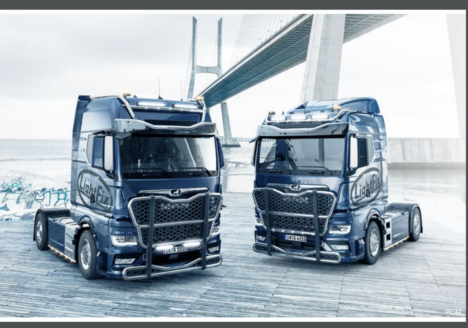
Please review the specific requirements for additional lighting mounted on commercial vehicles in your country. The pictures in this brochure show international vehicles that do not always comply with the admission rules of all countries.