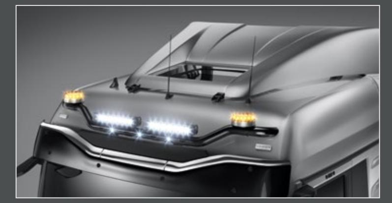
21702-8-B - LightFix - SKY-LIGHT "WING" Lightbar for mounting a maximum of 4 spotlights and 2 beacons stainless steel - black powdercoated (paintable) - Ø 70mm - prewired Note: for model range until 2021 select 21702-2-B