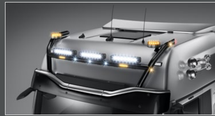
21705-6-B - LightFix - SKY-LIGHT "H-TYPE" Lightbar for mounting a maximum of 6 spotlights and 2 beacons stainless steel - black powdercoated (paintable) - Ø 70mm - prewired red LEDs in the tube ends Note: also suitable for model range until 2021