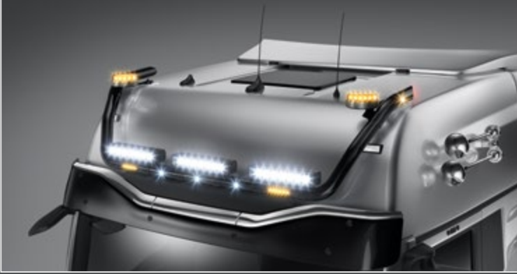
21706-4-B - LightFix - SKY-LIGHT "WILDLIFE" Lightbar for mounting a maximum of 6 spotlights and 2 beacons stainless steel - black powdercoated (paintable) - Ø 70mm - prewired red LEDs in the tube ends Note: for model range until 2021 select 21705-4-B