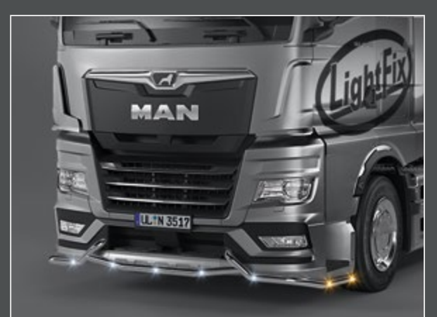
21741-1-P - LightFix - FRONT-LINER "S" Stainless steel LED-lightbar at the front polished - Ø 60mm - prewired Full LED set included