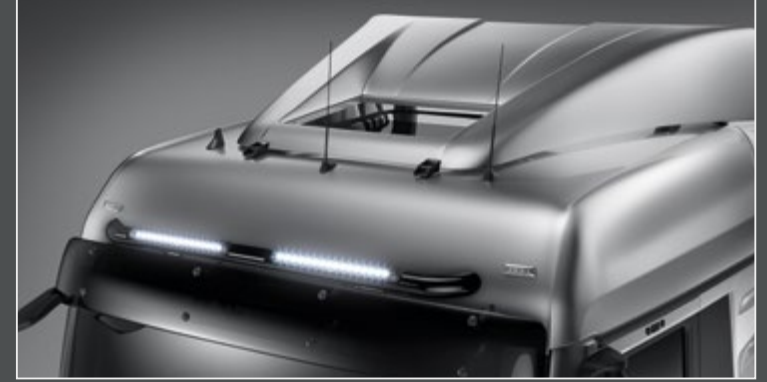
21705-3-B - LightFix - SKY-LIGHT "SLIM" Lightbar for mounting integrated LED spotlights stainless steel - black powdercoated (paintable) - Ø 70mm - prewired Note: not suitable for INDIVIDUAl sun visor