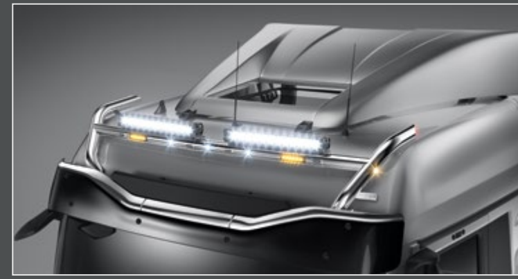
21702-5-P - LightFix - SKY-LIGHT "H-TYPE" Lightbar for mounting a maximum of 6 spotlights and 2 beacons stainless steel - polished - Ø 70mm - prewired red LEDs in the tube ends Note: also suitable for model range until 2021