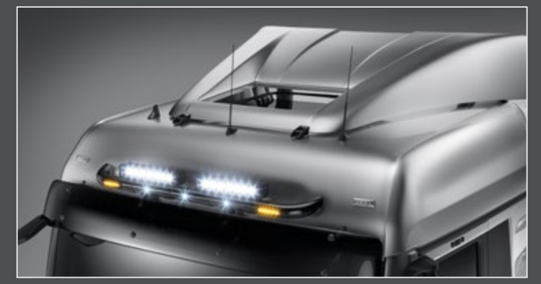
21705-1-B - LightFix - SKY-LIGHT "MINI" Lightbar for mounting a maximum of 4 spotlights stainless steel - black powdercoated (paintable) - Ø 70mm - prewired Note: not suitable for INDIVIDUAl sun visor

Note: for model range until 2021 select 21702-4-B