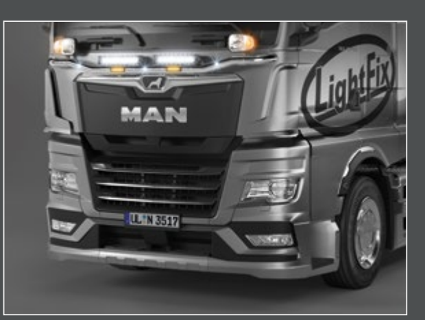
21750-3-P - LightFix - PLOW-LIGHT Lightbar at the front for mounting 2 main headlights and 4 spotlights Stainless steel - polished - Ø 70mm - prewired suitable for snow plows and municipal vehicles