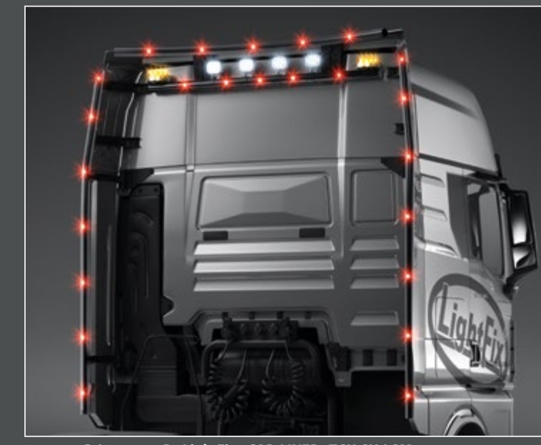
21748-5-B / 21748-6-B - LightFix - CAB-LINER - TGX GX / GM MAN TGX GX (21748-5-B) / MAN TGX GM (21748-6-B) Stainless steel LED-lightbar for driver and passenger side black powdercoated - Ø 70mm - prewired - Full LED-set includet

21748-9-B - LightFix - ROOF-LINER - TGX GX Stainless steel LED-lightbar for max. 4 work lamps and 2 beacons on the roof spoiler black powdercoated - Ø 70mm - prewired - Full LED-set included