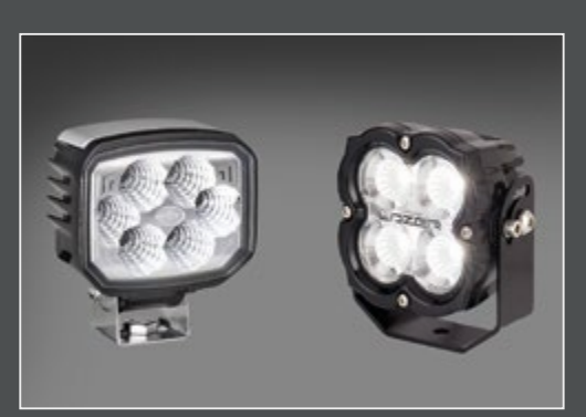
LightFix - WORKLAMP-BOX fitted with 2 or 4 Hella Power Beam 1500

BOX4-A225X-B · NBB Alpha 225 Xenon · clear lens · Xenon with LED-position light BOX6-A225X-B · NBB Alpha 225 Xenon · clear lens · Xenon with LED-position light