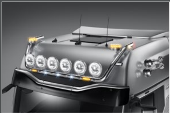
21706-4-P - LightFix - SKY-LIGHT "WILDLIFE" Lightbar for mounting a maximum of 6 spotlights and 2 beacons stainless steel - polished - Ø 70mm - prewired red LEDs in the tube ends Note: for model range until 2021 select 21705-4-P