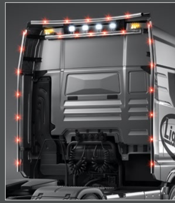
21748-5-P / 21748-6-P - LightFix - CAB-LINER - TGX GX / GM MAN TGX GX (21748-5-P) / MAN TGX GM (21748-6-P) Stainless steel LED-lightbar for driver and passenger side polished - Ø 70mm - prewired - Full LED-set included

21748-9-P - LightFix - ROOF-LINER - TGX GX Stainless steel LED-lightbar on the roof spoiler for max. 4 work lamps and 2 beacons