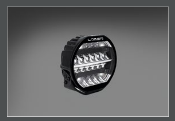
LightFix - SPOTLIGHT-BOX fitted with Lazer SENTINEL-BLACK

BOX4-SENT-B · Lazer SENTINEL-BLACK · clear lens · Full-LED with LED-position light BOX6-SENT-B · Lazer SENTINEL-BLACK · clear lens · Full-LED with LED-position light