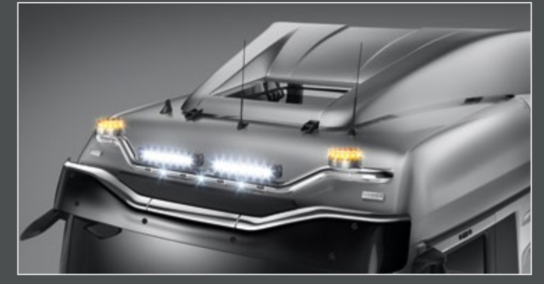
21702-8-P - LightFix - SKY-LIGHT "WING" Lightbar for mounting a maximum of 4 spotlights and 2 beacons stainless steel - polished - Ø 70mm - prewired Note: for model range until 2021 select 21702-2-P