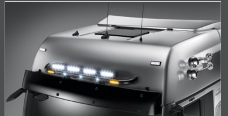
21705-1-B - LightFix - SKY-LIGHT "MINI" Lightbar for mounting a maximum of 4 spotlights stainless steel - black powdercoated (paintable) - Ø 70mm - prewired Note: not suitable for model range from 2022