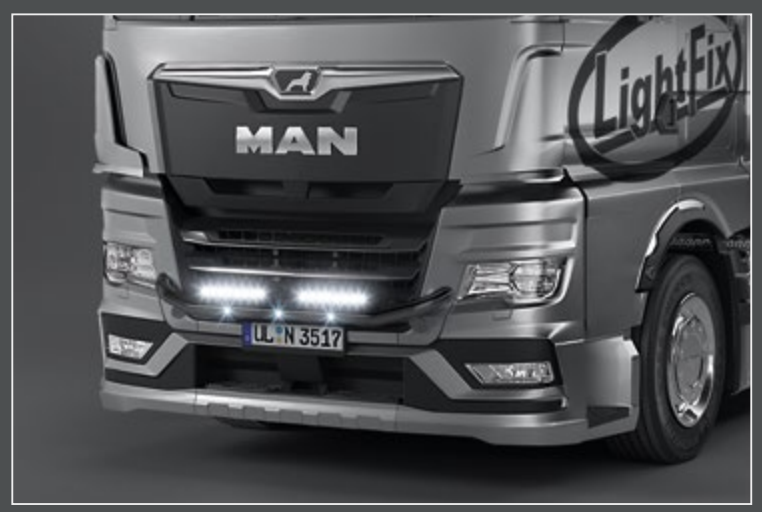
21720-6-B - LightFix - 4-LIGHT "MINI" Lightbar at the front for mounting a maximum of 4 spotlights stainless steel - black powdercoated - Ø 70mm - prewired