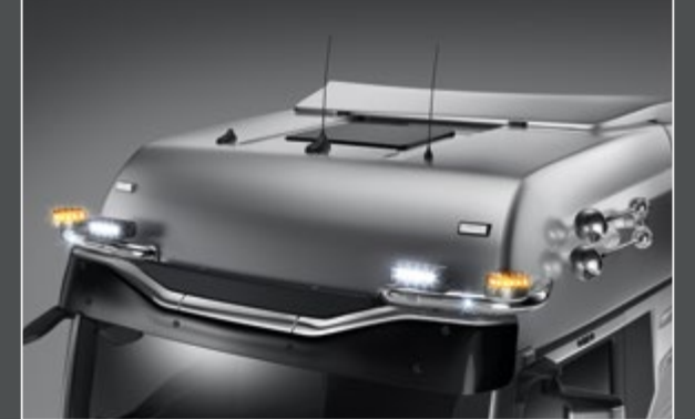
21706-10-P - LightFix - SKY-EYES Lightbar for mounting a maximum of 2 spotlights and 2 beacons stainless steel - polished - Ø 70mm - prewired Note: for model range until 2021 select 21702-3-P