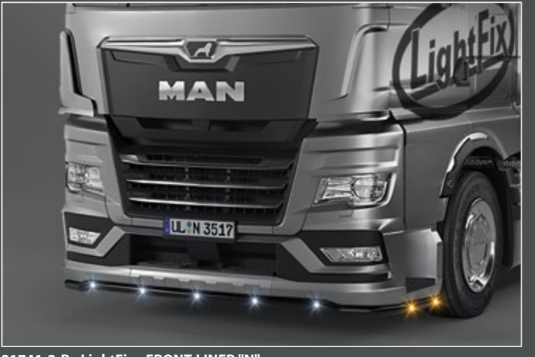
21741-2-B - LightFix - FRONT-LINER "N" Stainless steel LED-lightbar at the front black powdercoated - Ø 60mm - prewired Full LED-set included