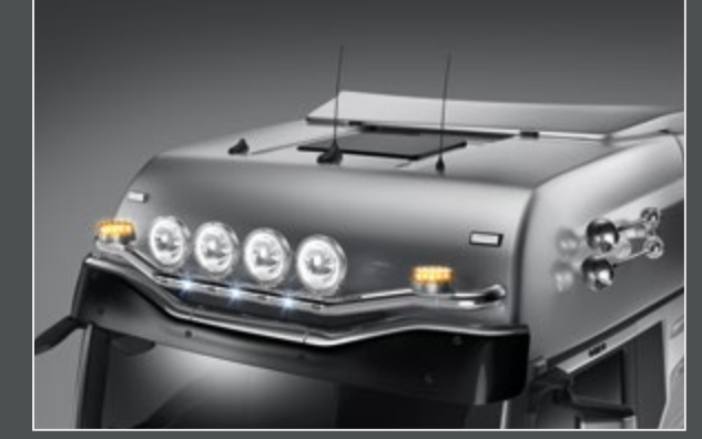
21706-2-P - LightFix - SKY-LIGHT "WING" Lightbar for mounting a maximum of 4 spotlights and 2 beacons stainless steel - polished - Ø 70mm - prewired Note: for model range until 2021 select 21705-2-P