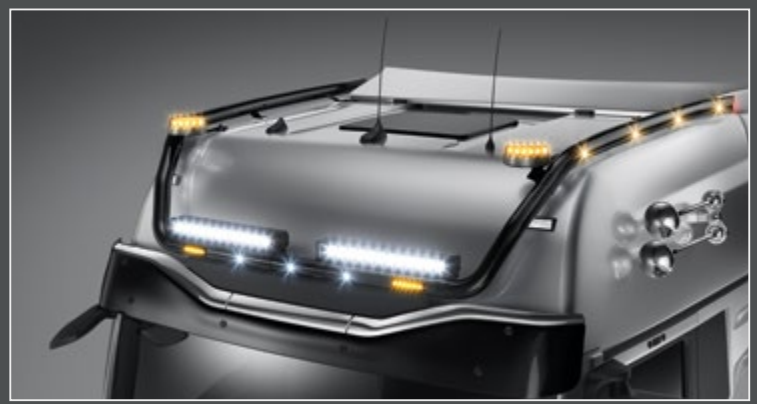
21706-5-B - LightFix - SKY-LIGHT "WILDLIFE MAX" Lightbar for mounting a maximum of 6 spotlights and 2 beacons stainless steel - black powdercoated (paintable) - Ø 70mm - prewired amber LEDs on the side and red LEDs in the tube ends Note: for model range until 2021 select 21705-5-B