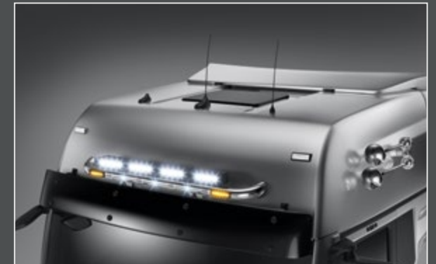
21705-1-P - LightFix - SKY-LIGHT "MINI" Lightbar for mounting a maximum of 4 spotlights stainless steel - polished - Ø 70mm - prewired Note: not suitable for model range from 2022