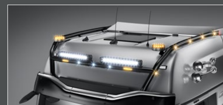
21705-7-B - LightFix - SKY-LIGHT "H-MAX" Lightbar for mounting a maximum of 6 spotlights and 2 beacons stainless steel - black powdercoated (paintable) - Ø 70mm - prewired amber LEDs on the side and red LEDs in the tube ends Note: also suitable for model range until 2021