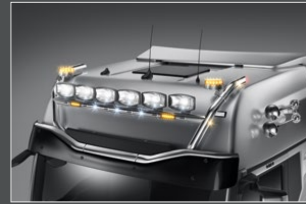
21705-6-P - LightFix - SKY-LIGHT "H-TYPE" Lightbar for mounting a maximum of 6 spotlights and 2 beacons stainless steel - polished - Ø 70mm - prewired red LEDs in the tube ends Note: also suitable for model range until 2021