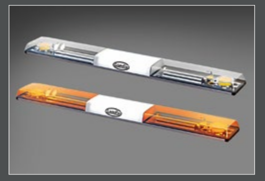
LightFix - BEACONBAR-BOX fitted with a white LED illuminated center section. Hoods are available in amber or transparent, including LightFix clamps, mounting brackets and LightFix Connect (12/A24V).

BOX2-U-45 · Lazer Utility 45 · 4500 Lumen · Gen2-LED BOX4-U-45 · Lazer Utility 45 · 4500 Lumen · Gen2-LED