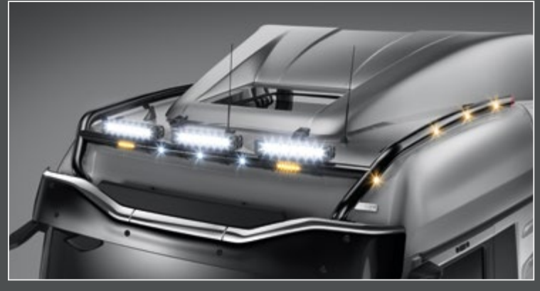
21702-7-B - LightFix - SKY-LIGHT "H-MAX"

21702-5-B - LightFix - SKY-LIGHT "H-TYPE" Lightbar for mounting a maximum of 6 spotlights and 2 beacons stainless steel - black powdercoated (paintable) - Ø 70mm - prewired red LEDs in the tube ends Note: also suitable for INDIVIDUAL sun visor