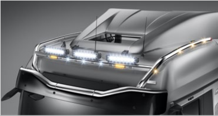
21702-7-P - LightFix - SKY-LIGHT "H-MAX" Lightbar for mounting a maximum of 6 spotlights and 2 beacons stainless steel - polished - Ø 70mm - prewired amber LEDs on the side and red LEDs in the tube ends Note: also suitable for model range until 2021