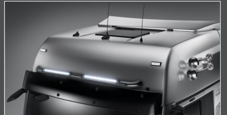
21705-3-B - LightFix - SKY-LIGHT "SLIM" Lightbar for mounting 2 integrated LED spotlights stainless steel - black powdercoated (paintable) - Ø 70mm - prewired Note: not suitable for model range from 2022