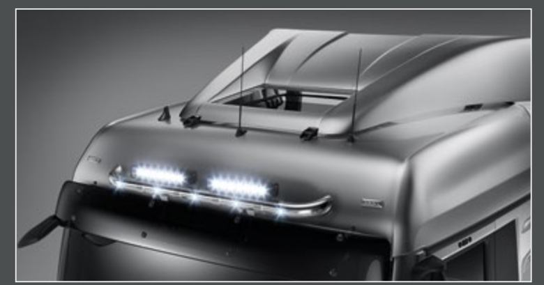
21705-1-P - LightFix - SKY-LIGHT "MINI" Lightbar for mounting a maximum of 4 spotlights stainless steel - polished - Ø 70mm - prewired Note: not suitable for model range from 2022